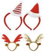
Novelty Headband - Assorted