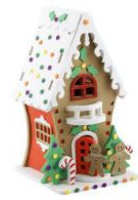
Make Your Own Foam Gingerbread House