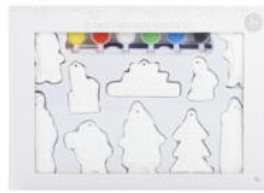
10 Pack Christmas Plaster Set