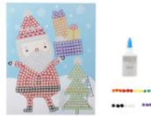
Christmas Pom Pom Activity Kit