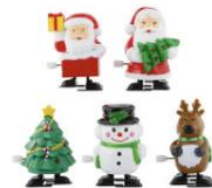
Christmas Wind Up Toys - Assorted